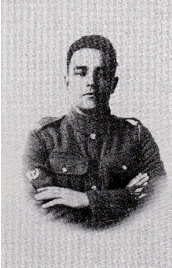
Soldier displaying T wreath and signaller's badges (not Walter Ayers - but these were the badges he sported)